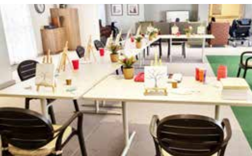
Creating artwork together

Equipped with the necessary art supplies: canvases, paintbrushes, paints, palettes, water cups, and easels, our resident artists gathered to enjoy a session of Sip n Paint together. It's a therapeutic and self-expressing activity to do with friends whilst enjoying a drink of choice. The activity encouraged conversation and interaction amongst the group. All were delighted with their finished art and had a great time doing a challenging and creative activity. Have a look at the art displayed in the cabinets on the ground floor.