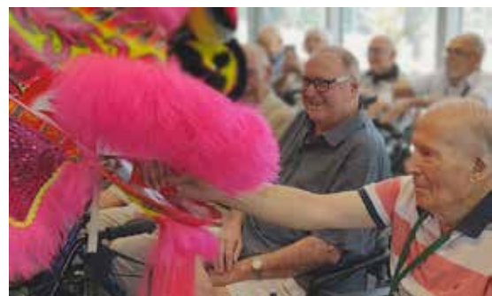
Barney offering a red envelope to the lion