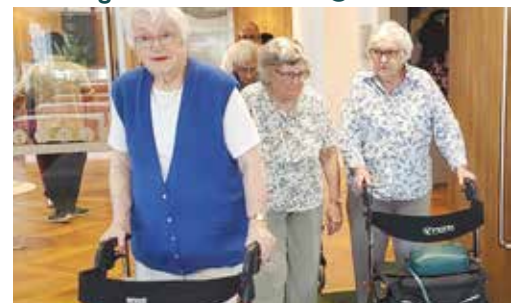
Leederville friends arriving for the lion dance performance @West Perth