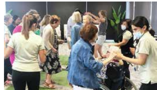
The dance floor is packed at Rosies Friday Social gathering @West Perth