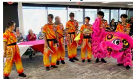
Lion dancers & drummers from Chung Wah Association @West Perth