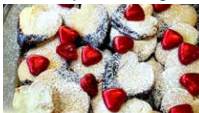
Delicious homemade cookies