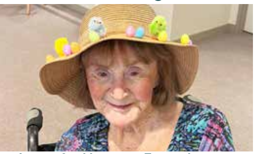
lan crafted her own Easter bonnet @Leederville