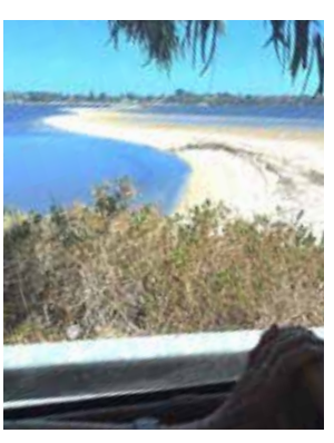
One of the stops