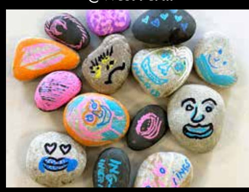
Residents' rock art creations @Leederville