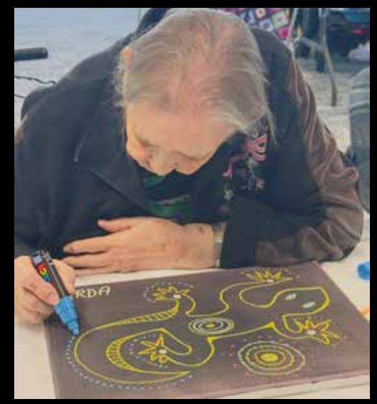
Maggie's dot painting @West Perth 20 residents shared time together creating stunning and unique dot paintings at West Perth