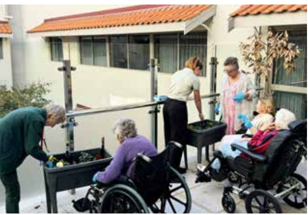
Some time shared on the balcony planting Pansies