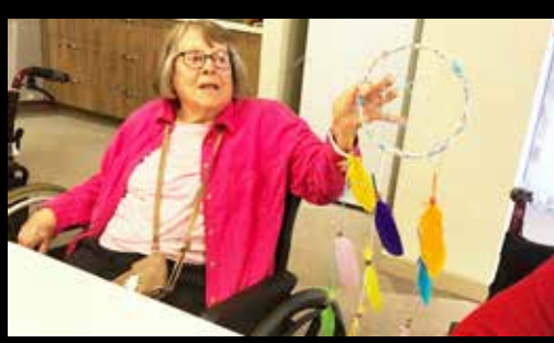
Mary's dream catcher @Leederville