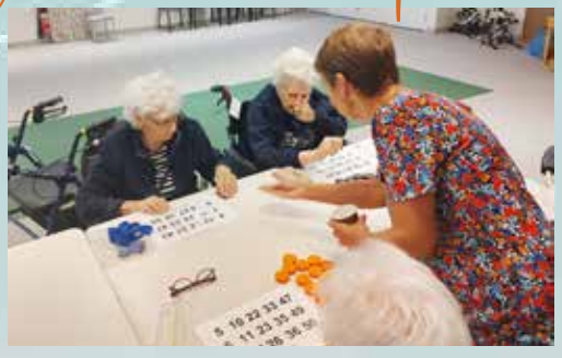
Bingo's a blast! @Leederville