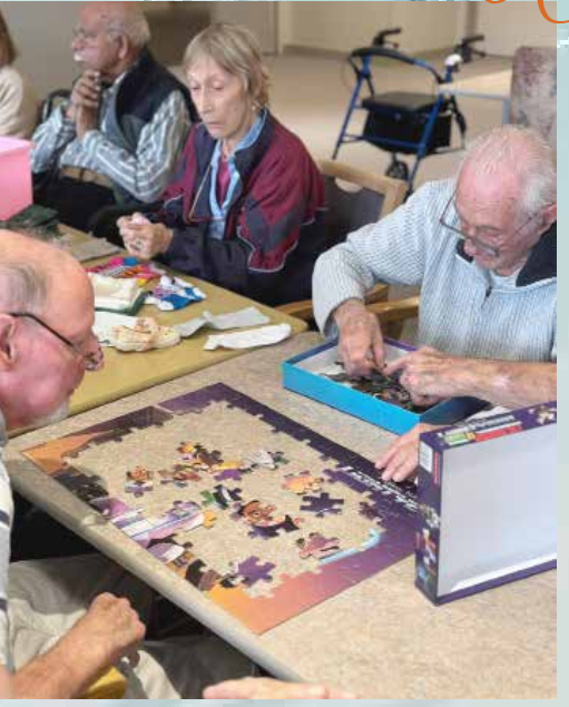
Puzzle session ~ piece together the fun! @Leederville