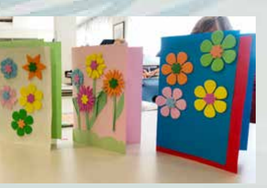
Cheerful card making on a winter's day @Leederville