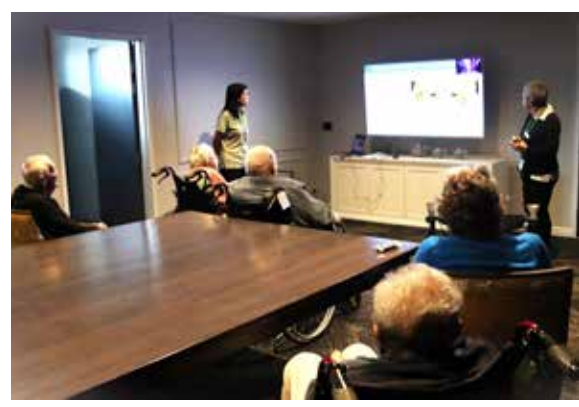
It's Teamific Global Quiz day!