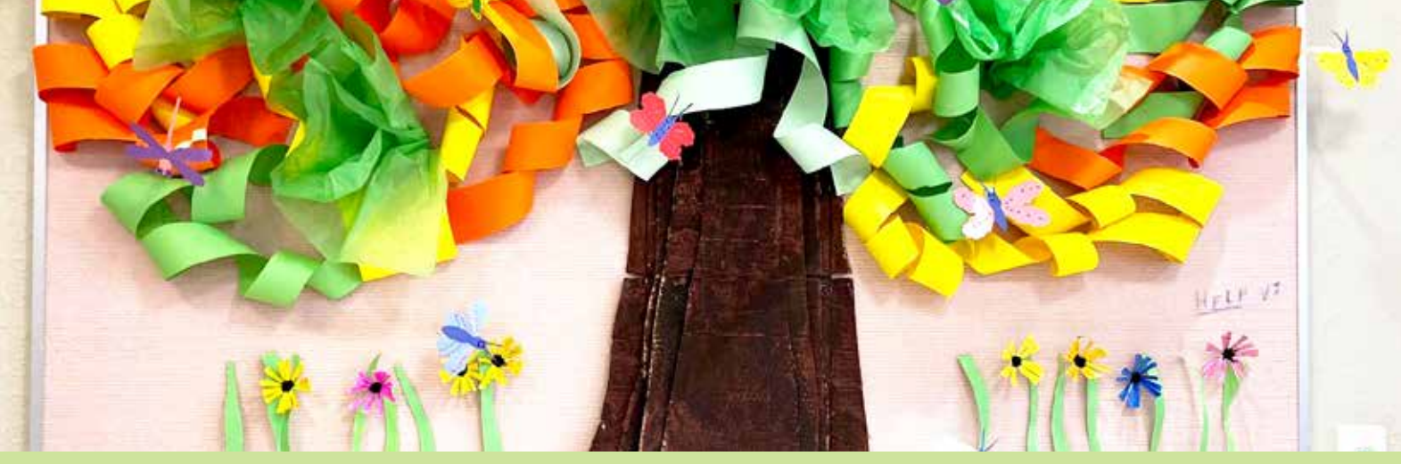
"A Springtime Journey" Art and Craft piece created by Leederville residents