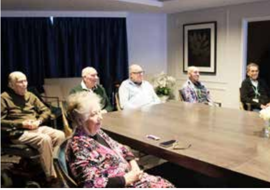
Our Team look forward to the monthly quiz and thoroughly enjoy working together to lock in their answers!

Some residents play as a team against other aged care homes and retirement villages. There are monthly prizes to be won! The quiz is thought-provoking and interactive! It encourages our team to engage to answer the questions that challenge their knowledge. They work swiftly together to lock in their answers!