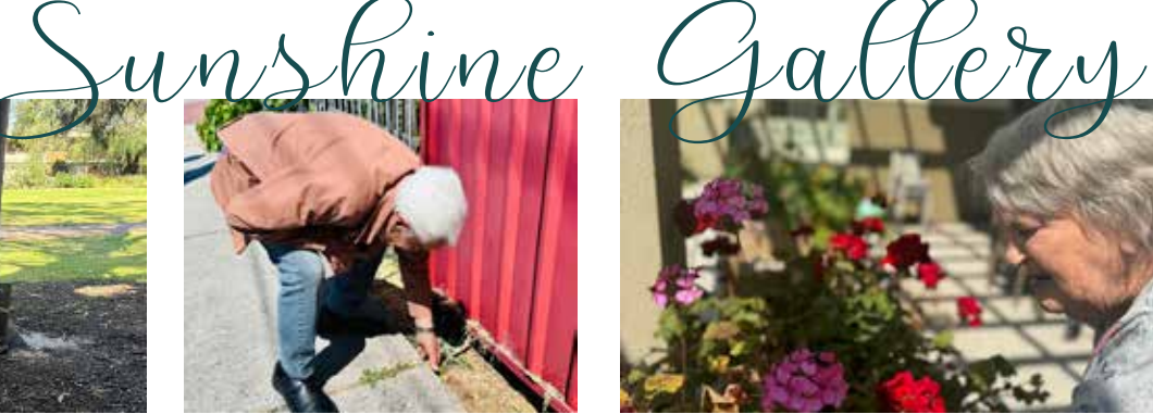
Jean smelling the perfumed flowers @Leederville