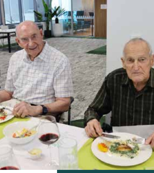
The Rosewood <u>Post</u> September 2024