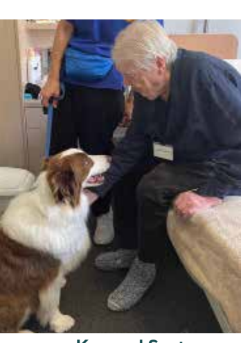
Ken and Santos

Visits from our furry companions brought an extra spark of joy, filling the space with smiles and warmth that only these lovable animals could provide!