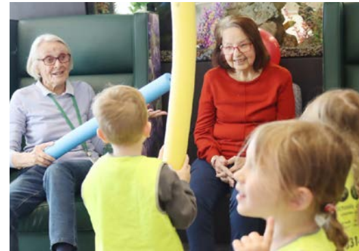
Lots of smiles over balloon tennis @West Perth