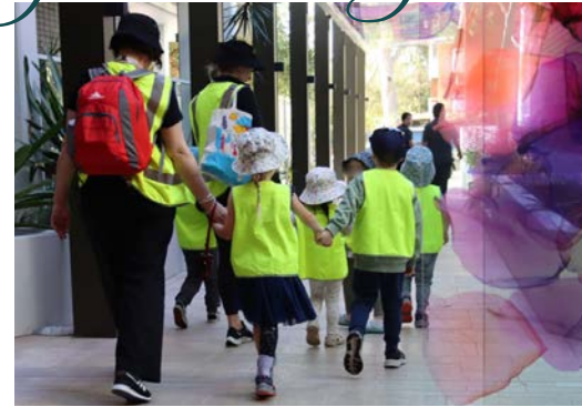
Can't wait for next visit! @West Perth