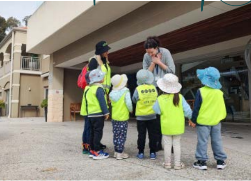
Excited 4 year olds first visit @Leederville