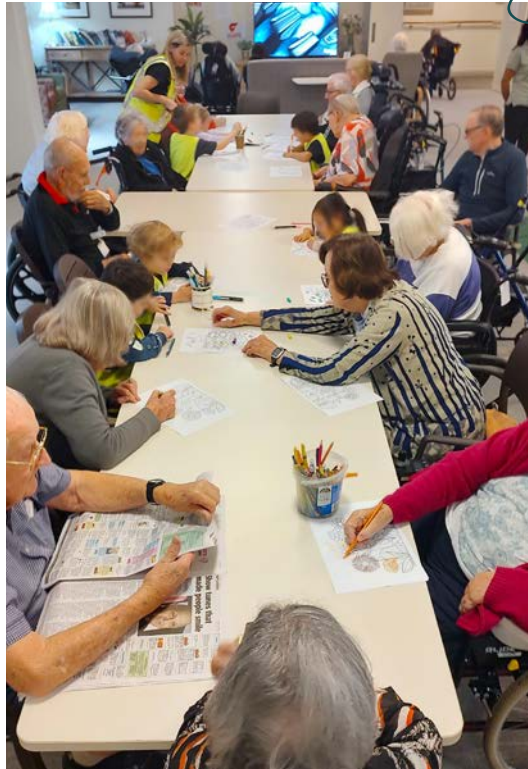
Calming colouring, uniting generations through artistic expression @Leederville