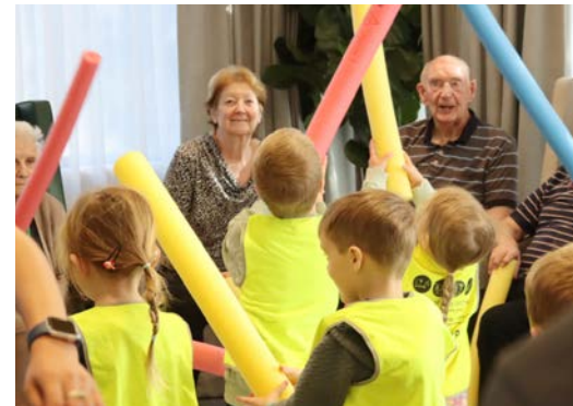
Laughter as two generations keep the balloons flying @West Perth