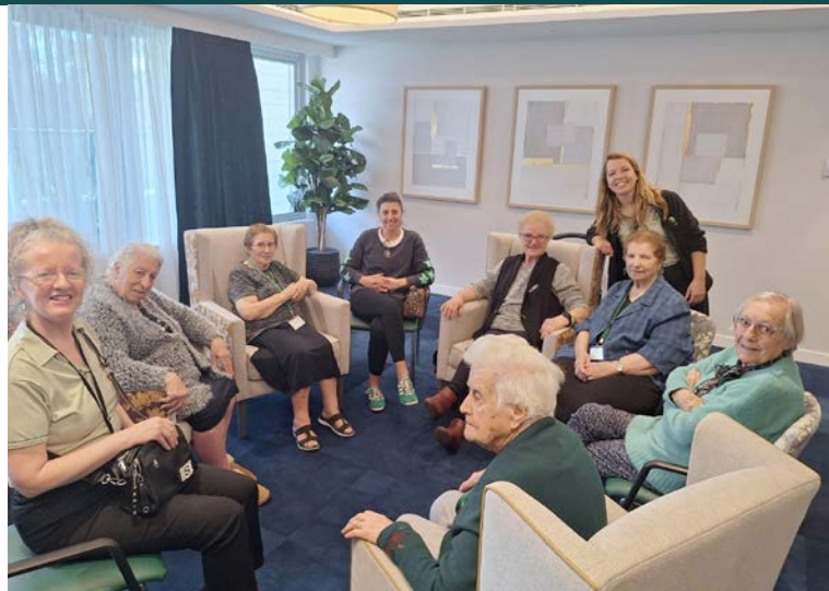
Some of the lovely Italian Club members enjoying the catch up!

Each week, a special group gathers at home – united by language, culture and a love for all things Italian. The Italian Club offers residents with Italian heritage a warm and welcoming space to reconnect with their roots, share memories and celebrate la bella vita – the beautiful life. Conversations flow easily, often in Italian, as residents chat about their childhoods, family traditions, favourite meals and memorable moments. There's laughter, listening and storytelling that stir fond memories and bring smiles all around. Thank you to Italo-Australian Welfare & Cultural Centre Inc (IAWCC) for supporting the Italian Group at West Perth.