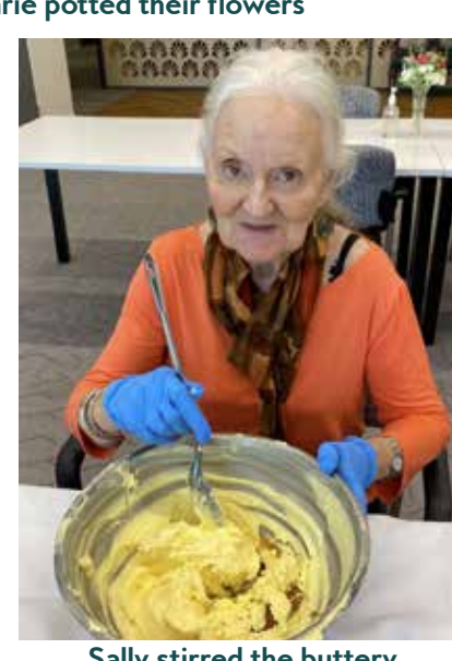
Sally stirred the buttery goodness with care