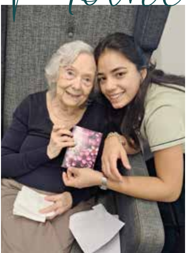
Winkie on Mother's Day @West Perth