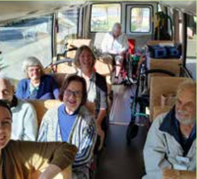
Leederville off to the Garden