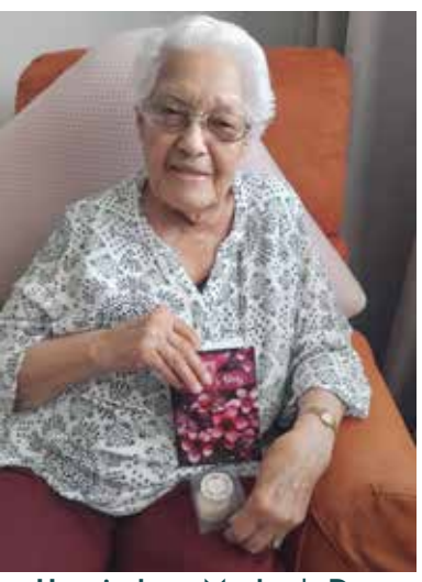
Hyacinth on Mother's Day @Leederville