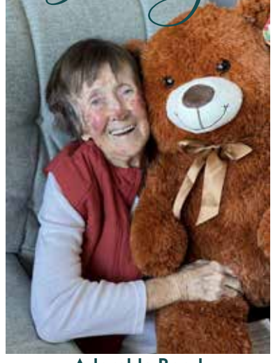
Adorable Beryl @West Perth