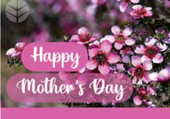
"You are my world, Mum. "Happy Mother's Day!