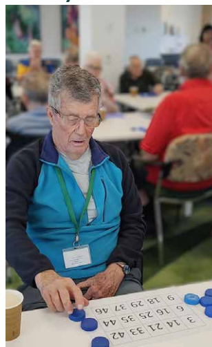
George ready for a win!