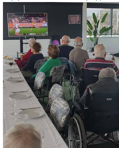
Reliving the laughs and highlights!